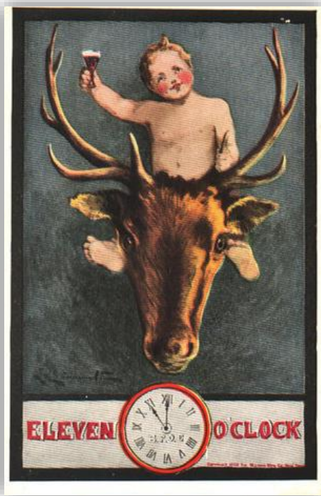
Vintage Elks Lodge New Years Card