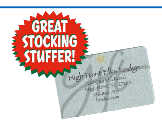
FOR THE MONTH OF December, Purchase $25 LOD9e Gift Cards FOR ONLY $20 each!

Interested in helping with one of our volunteer groups or an event? Call our office and we'll put you in touch with the following leaders in our organization: