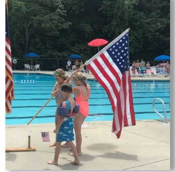
Children at the pool assisting with our Annual Flag Day Ceremony that was held on June 13 th .