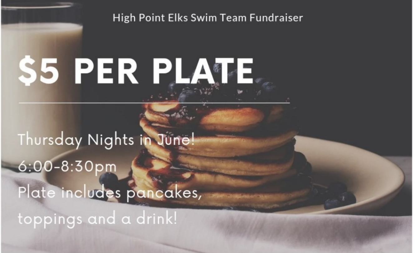
Plate includes pancakes, toppings and a drink!